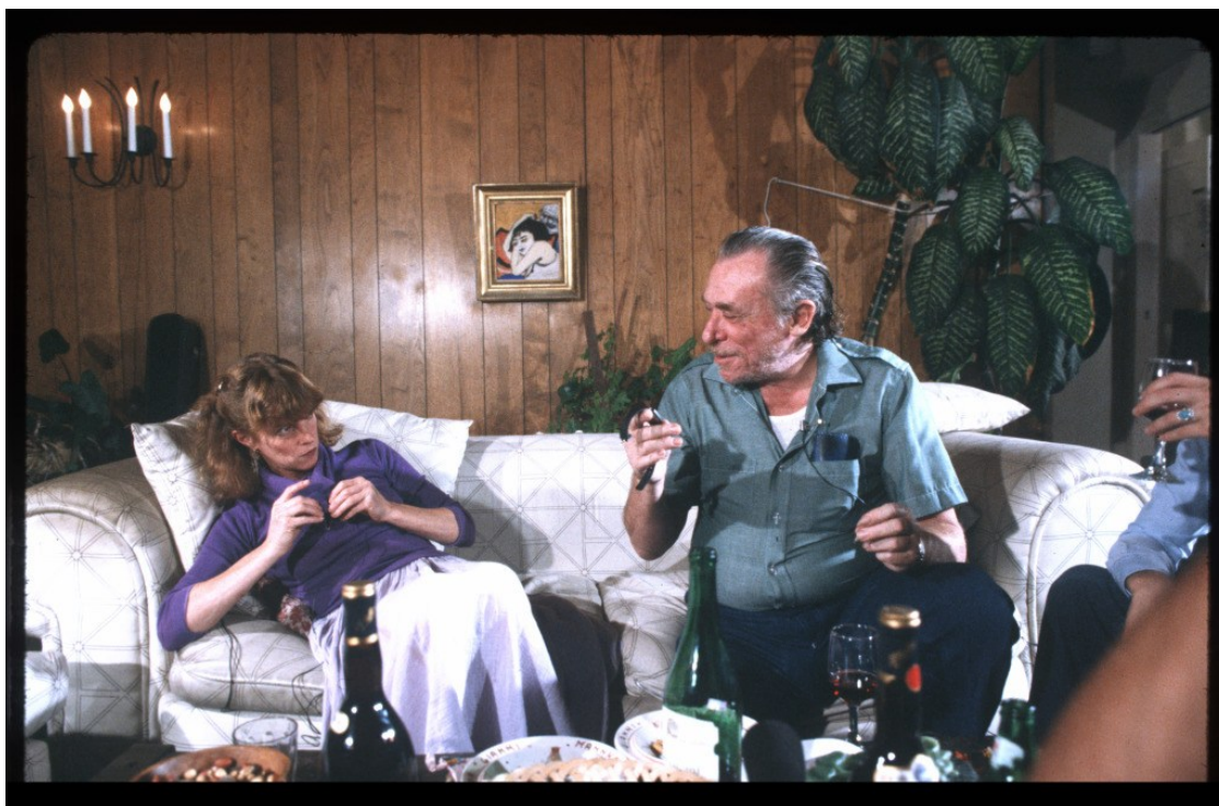
You Never Had It – An Evening with Charles Bukowski (still)