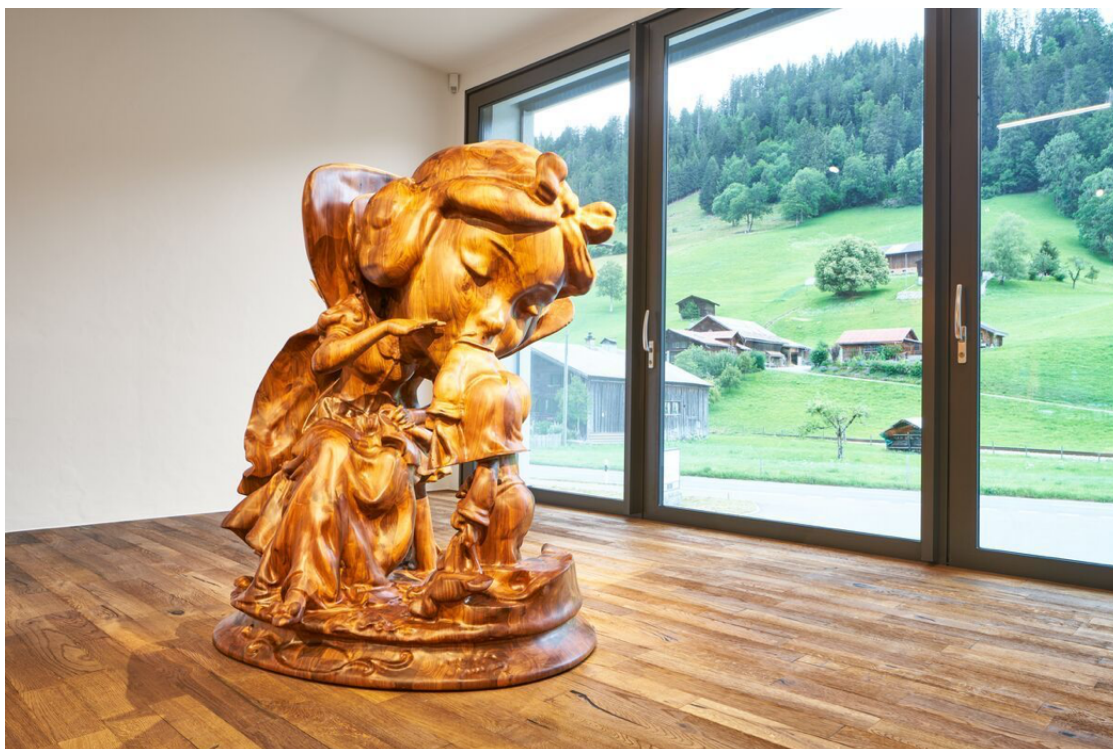
Installation View, Paul McCarthy: Alpine Stories and Other Dystopias at Tarmak22, Gstaad