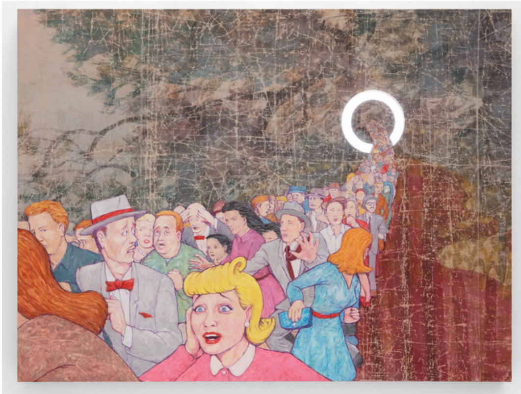
Jim Shaw, The Vicious Circle , 2020. Oil pastel and oil paint on board, muslin, LED 48 1:16 x 64 1:8 x 3 inches (Courtesy of Blum & Poe)

5,471 miles at Blum & Poe. As gallery spaces began reopening to visitors, both the gallery's Los Angeles and Tokyo spaces re-opened their doors (by appointment only of course). To mark this hopeful yet unfamiliar milestone, the gallery opened a pair of exhibitions at each location, focusing on the work of artists working mostly in each city. It is 5,471 miles from L.A. to Tokyo. In essence a really strong summer group show, there is an undercurrent of melancholy and mystery that pervades the selections. "The curatorial theme is a paradox," states the gallery materials, "in that it is both an internationally minded twin-city exhibition but is also inherently restricted [because] of the pandemic. The exhibition in each city is defined equally by the works that are there as by those that are not there." Blum & Poe, 2727 S. La Cienega Blvd., Culver City; by appointment, Tuesday-Saturday, 10am-6pm; through August 15; blumandpoe.com ( https://blumandpoe.com/exhibitions/5471_miles_los_angeles ).