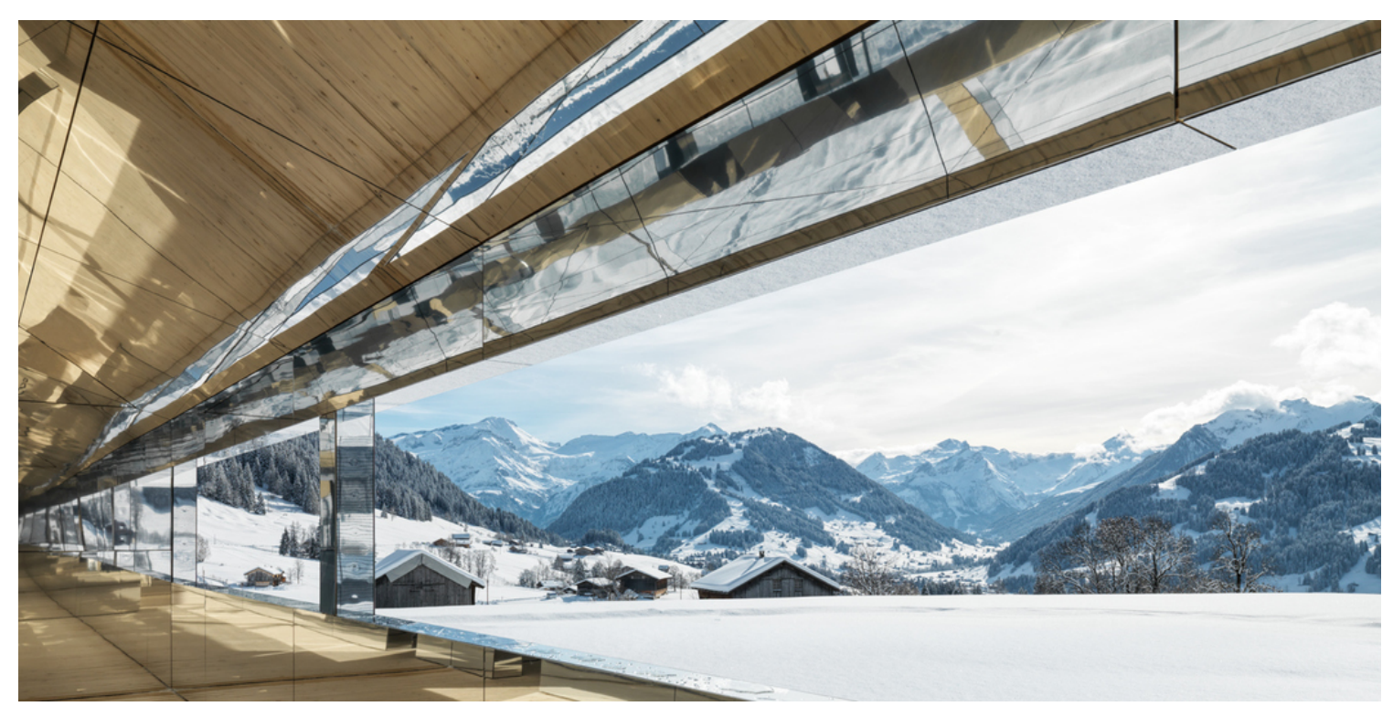
Doug Aitken, Mirage Gstaad, 2019.