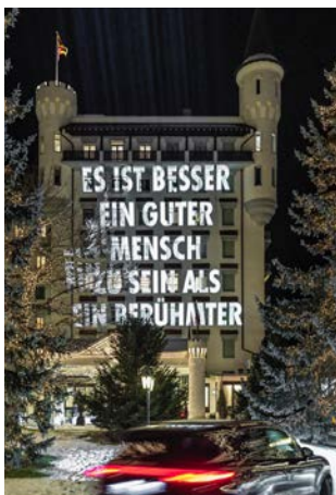
Center image and below: Jenny Holzer: A LITTLE KNOWLEDGE Tarmak 22, Gstaad 27 December 2019-22 January 2020

Holzer's art will light up the Gstaad and landscape: she will project large, scrolling texts in light on the iconic Gstaad Palace Hotel white castle-like facade, projections will then take place daily between 7 - 8.30 pm until 17 February 2020. The projections are made possible with the generous support of Maja Hoffmann of the Luma Foundation and Alex Hank. Beginning in the 1970s with posters throughout New York City and continuing through recent light projections, her practice rivals ignorance with humour, and violence with kindness.