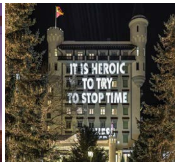
All images outdoor of the Palace Hotel: Jenny Holzer 'A LITTLE KNOWLEDGE CAN GO A LONG WAY' 2019 Light projections on the Gstaad Palace © Jenny Holzer, ARS, NY and DACS, London 2019 Courtesy the artist and Hauser & Wirth

Tarmak 22 exhibits a varied selection of Holzer's artworks, including the LED sign SWORN STATEMENT, which includes text from a 2004 United States Army Criminal Investigation Command document that looked into reports of abuse at Gardez Fire Base, an American outpost in Afghanistan. Various witnesses were interviewed - Afghan detainees, doctors, and American soldiers, but in the end, investigators ruled in favour of the US soldiers and concluded no wrongdoing had taken place. Holzer extracts these statements and displays them on the LED, in scrolling text.